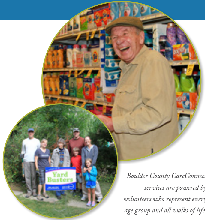
Boulder County CareConnect services are powered by volunteers who represent every age group and all walks of life.

Demonstrate Integrity In Every Action ~ Live Generously Through Volunteerism ~ Treat Everyone Like Family ~ Build Trust in Every Relationship ~ Be Curious, Creative and Courageous ~ Embrace Change ~ Be Remarkable